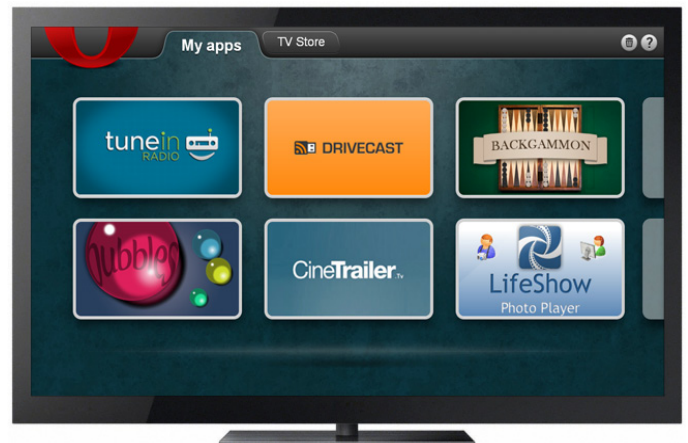
The "My Apps" area shows installed applications