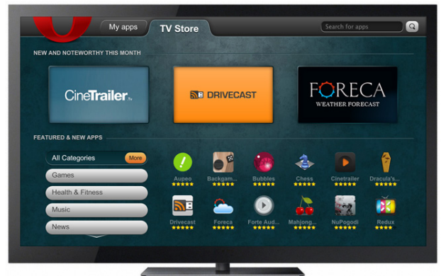
Opera TV Store

TV applications are typically video rich and designed to give the user a comfortable “lean-back” experience without complex interactions requiring typing or searching. They can be displayed within the TV grid as static thumbnails or dynamic applications and can be viewed in fullscreen or minimized modes. All TV applications are run from the cloud and are put into different categories, such as video and music entertainment, social networking, games, news and information.