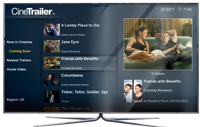
CineTrailer TV app in Opera TV Store