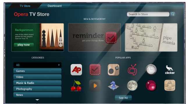
Opera TV Store

TV applications are typically video rich and designed to give the user a comfortable "lean-back" experience without complex interactions requiring typing or searching. They can be displayed within the TV grid as static thumbnails or dynamic applications and can be viewed in fullscreen or minimized modes. All TV applications are run from the cloud and are put into different categories, such as video and music entertainment, social networking, games, news and information.