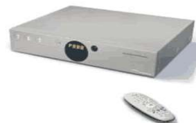
Canal + Pilotime DTH PVR STB. Opera 6 running on Media Highway

The Pilotime STB was launched in December 2003 within the Canal Satellite DTH operator network in France.