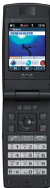
Kyocera WX 310K

In September, Opera announced that the Opera Mobile browser has been included on three new mobile phones from Kyocera in Japan: the Kyocera AH-K3002V, WX300K, and WX310K. All three phones have a dedicated Opera key on the keypad branded with Opera's logo. The phones are available in Japan through the Japanese mobile carrier, Willcom.